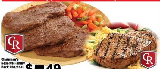
Chairman's Reserve Family Pack Charcoal Steaks Product of the USA