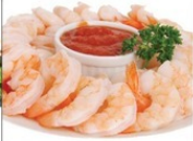
CenSea 31/40 Ct. Peeled Tail-On Cooked Shrimp 2 Lb.