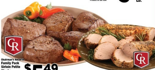
Chairman's Reserve Family Pack Sirloin Petite Steaks Product of the USA