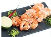
CenSea 31/40 Ct. EZ Peel Raw Shrimp 2 Lb.