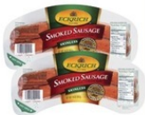
Eckrich Smoked Sausage Selected Varieties 10-14 Oz.