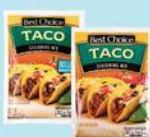
Best Choice Taco Seasoning 1.25 Oz., Selected Varieties