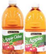
Best Choice Apple Juice or Apple Cider 64 Oz., Selected Varieties