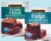
Best Choice Brownie Mix 16.5-18.9 Oz., Selected Varieties