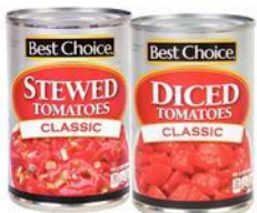
Best Choice Tomatoes 10-15 Oz., Selected Varieties