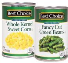
Best Choice Vegetables 14.5-15.25 Oz., Selected Varieties