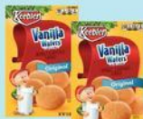
Keebler Original Vanilla Wafers 12 Oz.