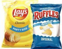
Frito-Lay Party Size Snacks 8.125-18 Oz., Selected Varieties