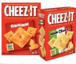
Cheez-It Baked Snacks 10.5-12.4 Oz., Selected Varieties