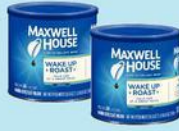
Maxwell House Wake Up Roast Ground Coffee 30.65 Oz.