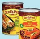
Old El Paso Enchilada Sauce 10 Oz., Selected Varieties