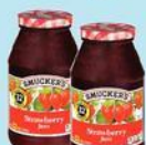
Smucker's Strawberry Jam 32 Oz.