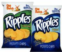
Old Dutch Ripples Potato Chips 8 Oz.