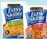
Best Choice Easy Skillet Rice & Sauce 5.4-5.7 Oz., Selected Varieties