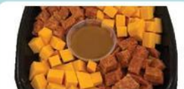
Cheese & Pepperoni Chunk Trays