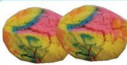
Tye Dye Cookies