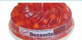
Lakeview Farms Jello Molds Assorted Varieties