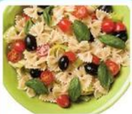
Italian Pasta Salad