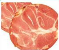
Carando Hot Ham