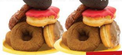
Made Fresh Every Morning! 1/2 Dozen Donuts