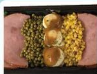
DINNER FOR TWO! Ham Dinner