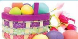
Easter Eggs 12 count