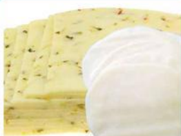
Fresh Sliced Provolone or Hot Pepper Cheese