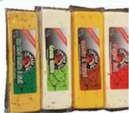
Cracker Top Cheese Bars Assorted Varieties