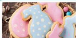
Easter Cut Out Cookies