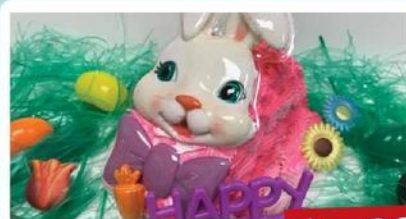
Easter Bunny Cakes