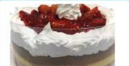
Fresh Made Strawberry Topped Boston Cream Cake