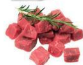
Beef Stew Meat boneless