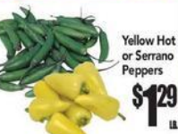
Yellow Hot or Serrano Peppers