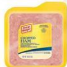
Chopped Ham or White Turkey

Oscar Mayer select varieties 16 oz. $1.99