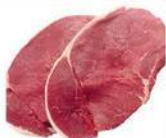
Beef Top Sirloin Steak preferred trim boneless family pack