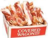
Covered Wagon Sliced Bacon