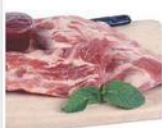
Baby Back Pork Ribs