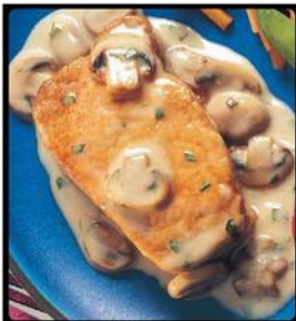
Smithfield Boneless Smoked Pork Chops