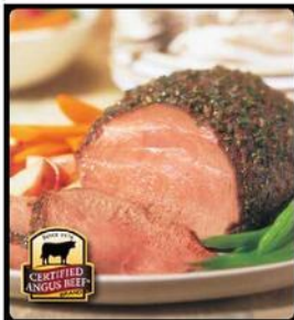
Certified Angus Beef USDA Choice Boneless Sirloin Tip Roast

Prices on this page valid 12/05/18 thru 12/11/18