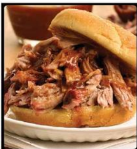
Our Own Homemade Pulled Pork in BBQ Sauce