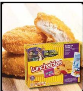
Oscar Mayer Funpack Lunchables