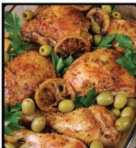
Family Pack Chicken Thighs and Drumsticks