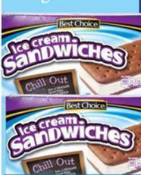
Best Choice Ice Cream Sandwiches 12 Ct.