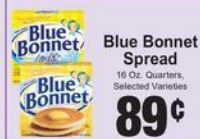
Blue Bonnet Spread 16 Oz. Quarters, Selected Varieties