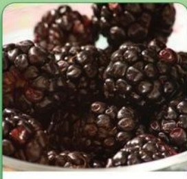
Fresh Blackberries 6 Oz.