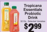
Tropicana Essentials Probiotic Drink 32 Oz., Selected Varieties