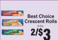
Best Choice Crescent Rolls 8 Oz.