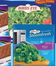
Birds Eye Vegetables 9.5-16 Oz., Selected Varieties