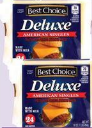
Best Choice Deluxe American Cheese 16 Oz.