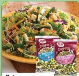
Dole Chopped! Salad Kit 10.8-14.4 Oz., Selected Varieties