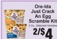
Ore-Ida Just Crack An Egg Scramble Kit 3 Oz., Selected Varieties