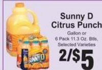
Sunny D Citrus Punch Gallon or 6 Pack 11.3 Oz. Btls., Selected Varieties