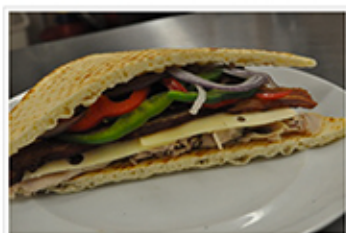
ALEENA'S SUNNY DAY SURPRISE

MAPLE HAM, BACON, APPLE SLICES, MELTED CHEDDAR WITH SPICY HONEY MUSTARD ON A BULIKE