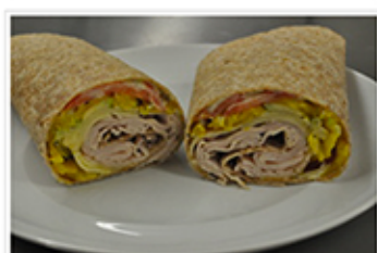
FROM LONDON WITH LOVE

**BONUS POINTS FOR YOUR BEST IMPRESSIONS** SALAMI, HAM, CAPICOLA, PROVOLONE, LETTUCE, TOMATO, ONION, BANANA PEPPERS, ITALIAN DRESSING ON TOASTED EUROPEAN BREAD