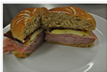
THE BIRDPORTER OUR MOST POPULAR