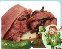
Fresh Sliced Corned Beef