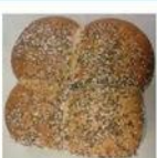
Fresh Baked Weck Rolls $2 99 8 ct.