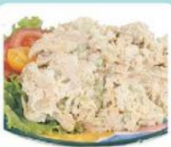
Our Own Chunky Chicken Salad