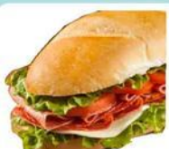
12 Inch Roast Beef & Swiss Sub