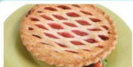
Fresh Baked 8 Inch Strawberry Rhubarb Pie