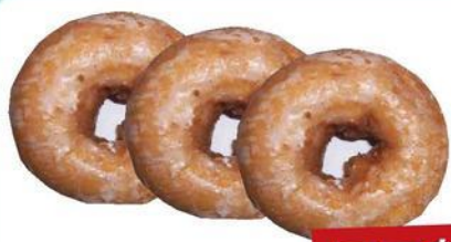
Made Fresh Every Morning! Fry Cakes