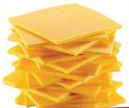
Fresh Sliced Yellow American Cheese