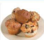
Assorted Muffins $3 99 4 ct.