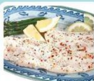
DINNER FOR TWO! Broiled Haddock Dinner