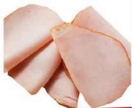
Kretschmar Oven Roasted Turkey Breast