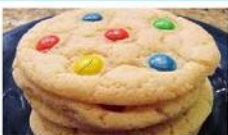
Fresh Baked M&M Sugar Cookies