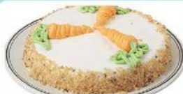
Fresh Made 8-Inch Carrot Cake