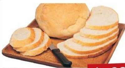
Fresh Baked Old Fashioned Sourdough Bread