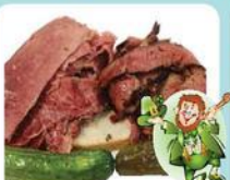
Fresh Sliced Corned Beef