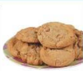
Homemade Peanut Butter Cookies $3.99 10 ct.