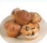
Assorted Muffins $3.99 4 ct.