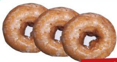
Made Fresh Every Morning! Fry Cakes