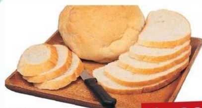
Fresh Baked Old Fashioned Sourdough Bread