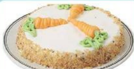
Fresh Made 8-Inch Carrot Cake