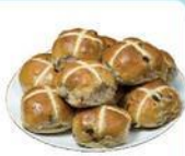
Hot Cross Buns $2.99 6 ct.