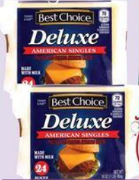
Best Choice Deluxe American Cheese 16 Oz.