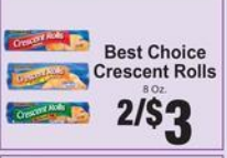
Best Choice Crescent Rolls 8 Oz.