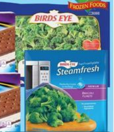
Birds Eye Vegetables 9.5-16 Oz., Selected Varieties