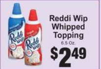
Reddi Wip Whipped Topping 6.5 Oz.