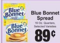
Blue Bonnet Spread 16 Oz. Quarters, Selected Varieties