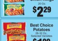
Best Choice Onion Rings 20 Oz.