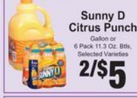
Sunny D Citrus Punch Gallon or 6 Pack 11.3 Oz. Btls., Selected Varieties