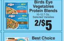
Birds Eye Vegetables Protein Blends 10-12.7 Oz., Selected Varieties