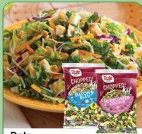
Dole Chopped! Salad Kit 10.8-14.4 Oz., Selected Varieties