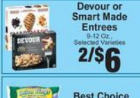
Devour or Smart Made Entrees 9-12 Oz., Selected Varieties