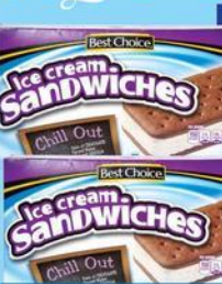
Best Choice Ice Cream Sandwiches 12 Ct.