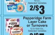
Best Choice Waffles 10 Ct., Selected Varieties