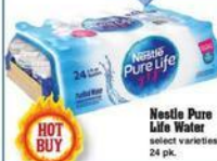
Nestle Pure Life Water select varieties 24 pk.