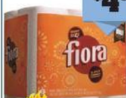
Flora Paper Towels select varieties 6 ct.