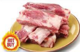
Pork Back Rib