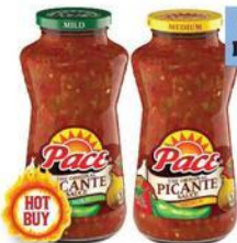
Picante Sauce select varieties 24 oz.