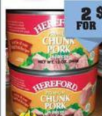
Hereford Chunk Pork select varieties 12 oz. can

Check out the other pages for more savings!