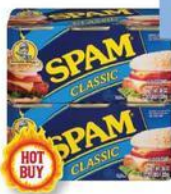
Spam select varieties 12 oz., 3 pk.