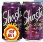
Shasta 6 pk.