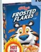
Kellogg's Cereal Select Varieties