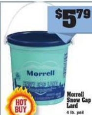
Morrell Snow Cap Lard 4 lb. pail