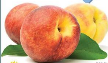
Offshore Peaches or Nectarines Juicy Sweet