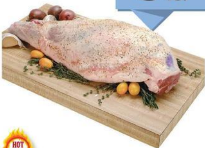
Fresh Cut Lamb