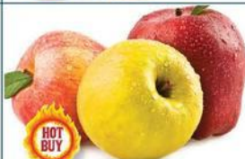
Premium Apples Gala, Golden or Red Delicious