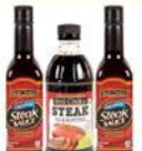
Best Choice Steak Sauce 2/1$3.88 10 to 10.5 oz.