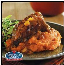
USDA Choice Star Ranch Angus Beef Boneless Short Ribs