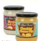
Best Choice Queso or Cheddar Cheese Dip 2/1$4.88 10 to 10.5 oz.