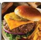
Our Own Homemade Frozen Pork or Ground Beef Patties