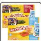
Oscar Mayer Funpack Lunchables