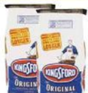
Kingsford Charcoal $8.99 10 to 10.5 oz.