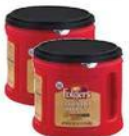
Folgers Country Roast Coffee $5.88 10 to 10.5 oz.