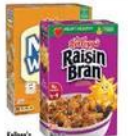
Kellogg's Cereal Raisin Bran 2/1$4.88 10 to 10.5 oz.