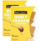
Best Choice Graham Crackers 2/1$3.88 10 to 10.5 oz.