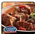
USDA Choice Star Ranch Angus Beef Boneless Arm Roast