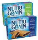
Kellogg's Nutri Grain Bars or Cakes 2/1$4.88 8 to 10.5 oz.