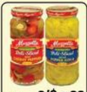
Mazola Peppers 2/1$4.88 10 to 10.5 oz.