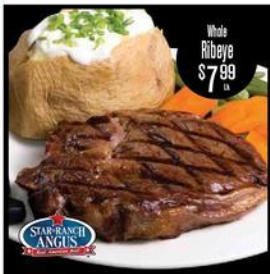
USDA Choice Star Ranch Angus Beef Boneless Ribeye Steak

Prices on this page valid 06/14/17 thru 06/20/17