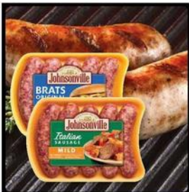
Johnsonville Fresh Bratwurst or Italian Sausage