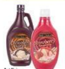
Best Choice Chocolate, Strawberry, or Caramel Syrup 2/1$3.88 10 to 10.5 oz.