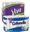
Cottonelle Bath Tissue or Viva Paper Towels $5.88 10 to 10.5 oz.