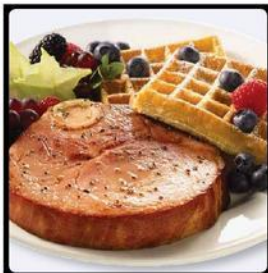
Cook's Bone-In Ham Steaks