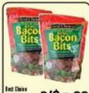
Best Choice Real Bacon Bits 2/1$3.88 10 to 10.5 oz.