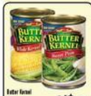
Butter Kernal Canned Vegetables 4/1$3 10 to 10.5 oz.