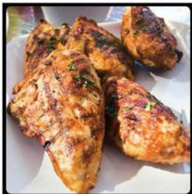
Family Pack Split Chicken Breast