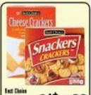
Best Choice Snack Crackers 2/1$4.88 10 to 10.5 oz.