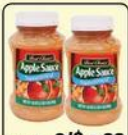
Best Choice Applesauce 2/1$2.88 10 to 10.5 oz.