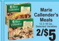
Marie Callender's Meals