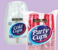
Best Choice Party or Cold Cups 40-50 Ct., Selected Varieties