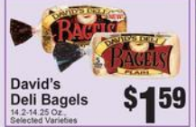
David's Deli Bagels