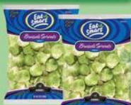
Eat Smart Brussel Sprouts