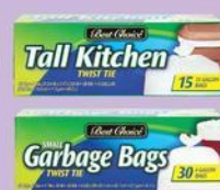
Best Choice Tall Kitchen or Garbage Bags 15-20 Ct., Selected Varieties