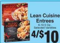
Lean Cuisine Entrees