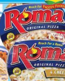
Roma Original Pizza