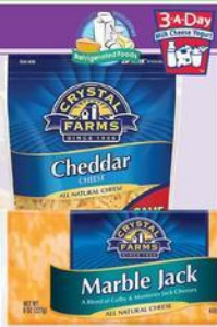
Crystal Farms Cheese