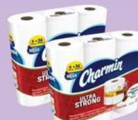
Charmin Ultra Bath Tissue 9 Mega Selected Varieties