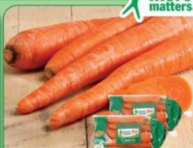
Green Giant Carrots