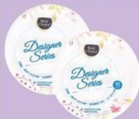
Best Choice Designer Series Paper Plates or Bowls 20-48 Ct., Selected Varieties