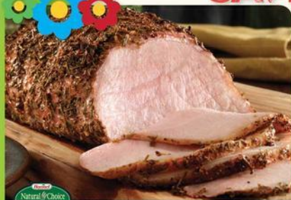
Pork Sirloin Roast Boneless