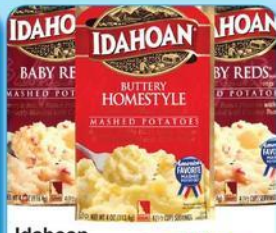
Idahoan Mashed Potatoes 3-4.1 Oz., Selected Varieties