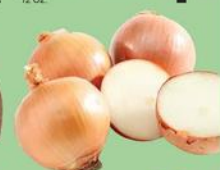
Lb. Vidalia Onions