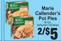
Marie Callender's Pot Pies