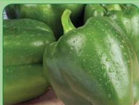
Green Bell Peppers