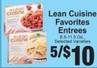
Lean Cuisine Favorites Entrees