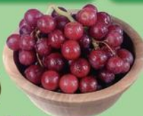
Red Seedless Grapes