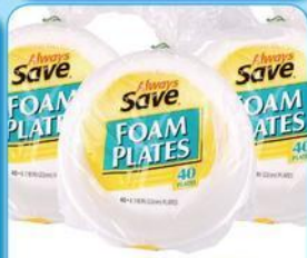
Always Save Foam Plates 40 Ct., 8 7/8 Inch