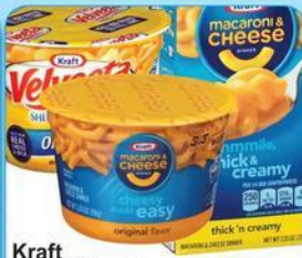
Kraft Macaroni & Cheese or Velveeta Shells & Cheese 1.9-2.39 Oz. Cup or Macaroni & Cheese Dinner 5.5-7.25 Oz., Selected Varieties