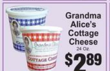
Grandma Alice's Cottage Cheese

Hash Browns or Cut Potatoes 20 Oz., Selected Varieties