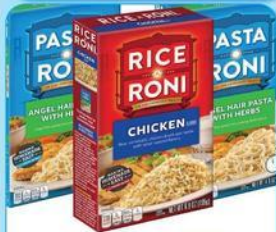
Rice A Roni or Pasta Roni 4.2-7.2 Oz., Selected Varieties