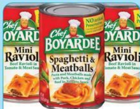
Chef Boyardee Pasta With Meat 14.5-15 Oz., Selected Varieties