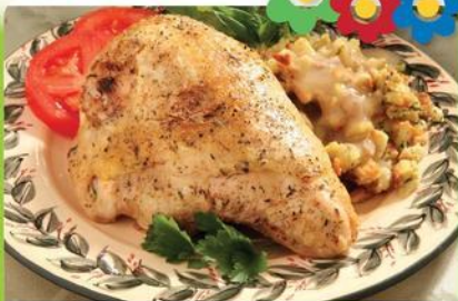
Bone-In Split Chicken Breast Grade A