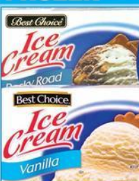
Best Choice Ice Cream