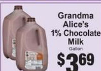
Grandma Alice's 1% Chocolate Milk