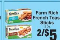
Farm Rich French Toast Sticks