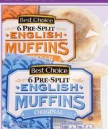
Best Choice English Muffins