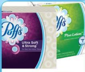
Puffs Facial Tissue 56-64 Ct., Selected Varieties