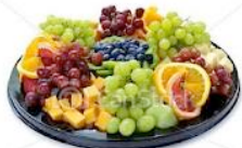
© Cici Stock Photo - csp232981

Small serves 8-12.....$34.99 Large serves 20-25.....$44.99